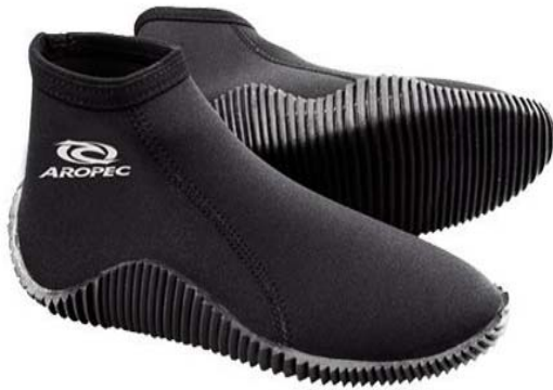
Brand: Aropec, made in Taiwan Model: Rock