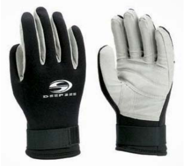
Brand: Aqualung, made in Taiwan Model: Deepsea