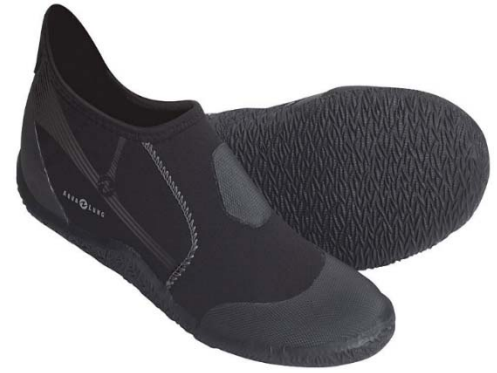
Brand: Aqualung, made in Taiwan Model: Polynesian