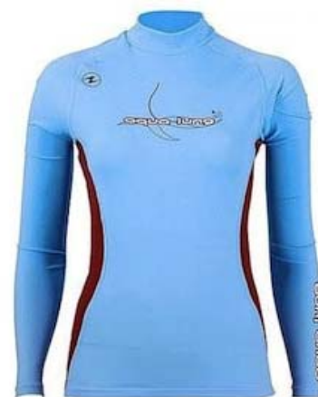
Brand: Aqualung, made in Taiwan Model: Aqua Titanium