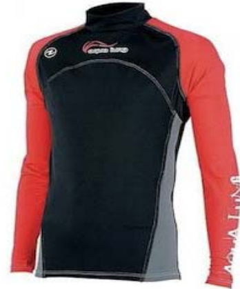
Brand: Aqualung, made in Taiwan Model: Red Titanium