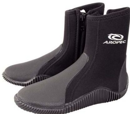
Brand: Aropec, made in Taiwan Model: Steamship