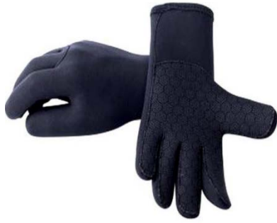
Brand: Poseidon, made in Sweden Model: Black Line