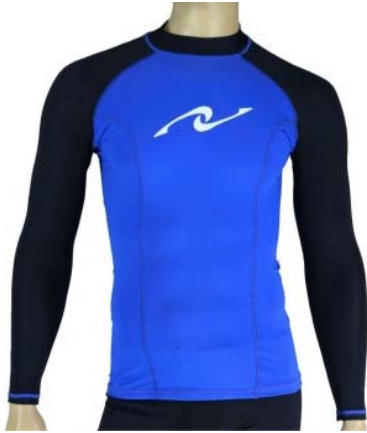
Brand: Procare, made in the Philippines Model: Male Version