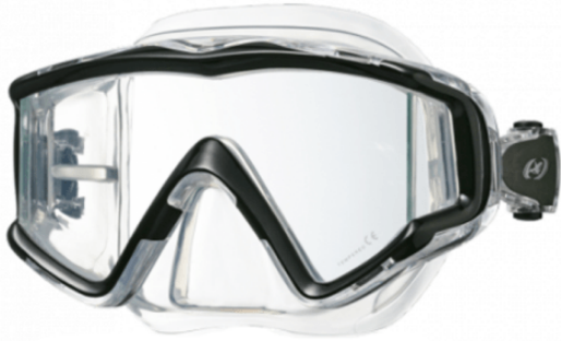
Brand: Problue, made in Taiwan Model: Vision Plus 3