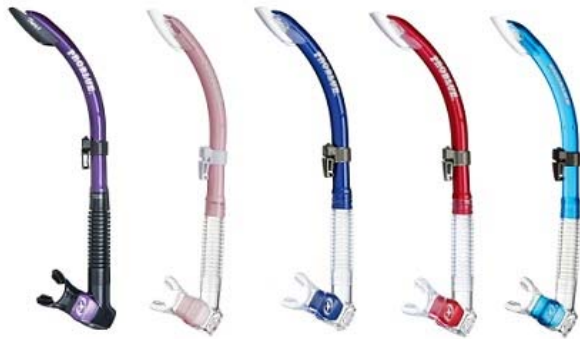
Brand: Problue, made in Taiwan Model: Tiara 2