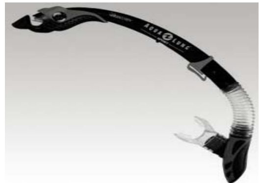
Brand: Aqualung, made in Taiwan Model: Sport Paradise Dry LX