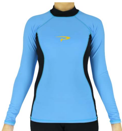
Brand: Procare, made in the Philippines Model: Female Version