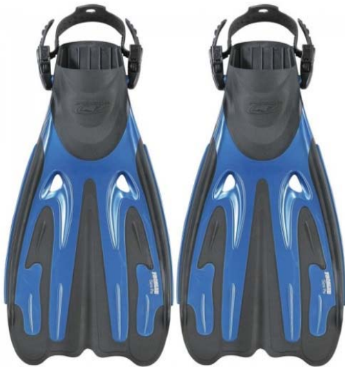
Brand: Problue, made in Taiwan Model: Tiara Pro open heel