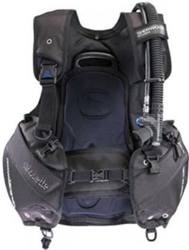
Brand: Sherwood, made in USA Model: Silhouette