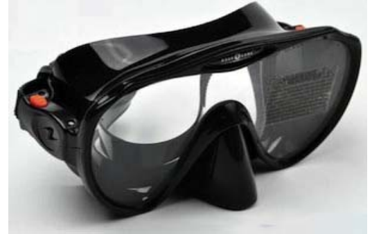
Brand: Aqualung, made in Taiwan Model: Sport Malibu Frameless