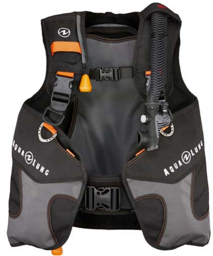
Brand: Aqualung, made in UK Model: Wave