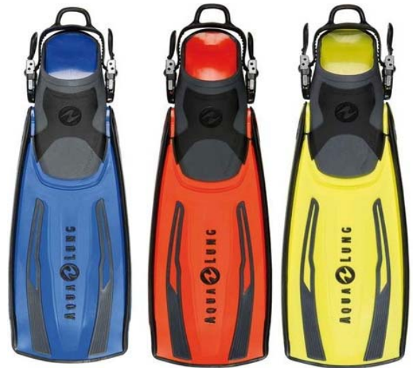
Brand: Aqualung, made in Taiwan Model: Stratos