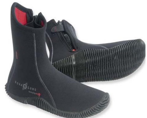
Brand: Aqualung, made in Taiwan Model: Ergo Zip