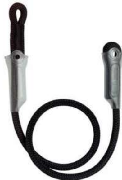
Brand: Petzl, made in France Model: Jane