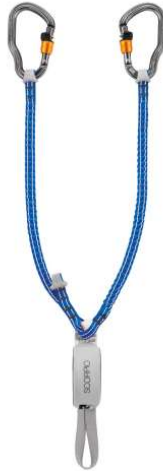
Brand: Petzl, made in France Model: Scorpio Vertigo