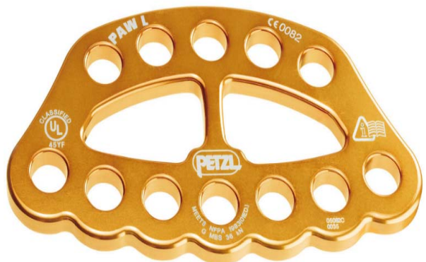
Brand: Petzl, made in France Model: PAW L