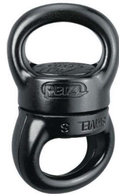
Brand: Petzl, made in France Model: Swivel S