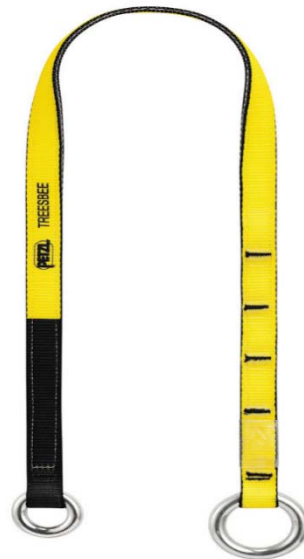
Brand: Petzl, made in France Model: Treesbee