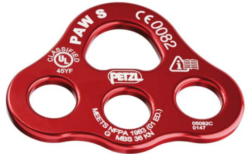
Brand: Petzl, made in France Model: PAW S