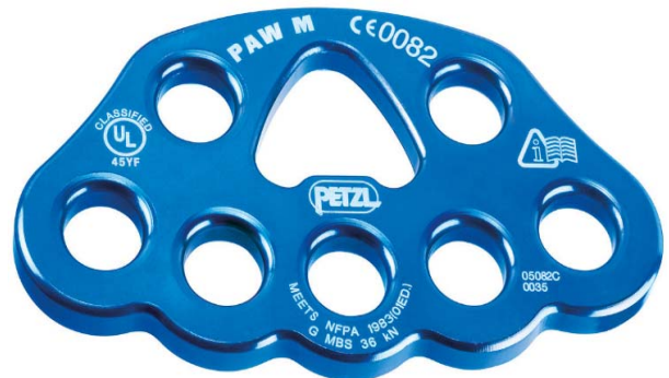
Brand: Petzl, made in France Model: PAW M