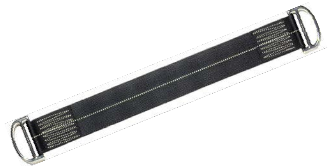
Brand: Petzl, made in France Model: Connexion Fixe