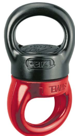
Brand: Petzl, made in France Model: Swivel L