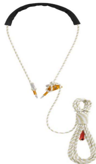
Brand: Petzl, made in France Model: Grillon Anchor