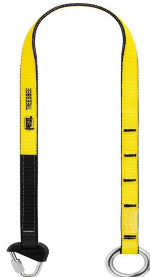
Brand: Petzl, made in France Model: Treesbee Screwlink