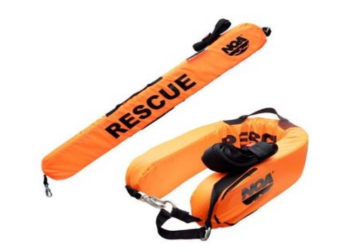
Brand: NOA, made in the Philippines